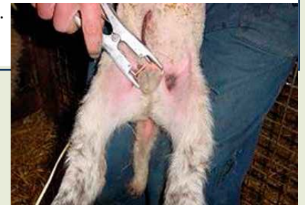
Figure 2: Castrating using rubber ring

* The Code of Practice details the legal requirements and industry accepted standards for responsible animal care on sheep farms in Canada. The Code is available for download from www.nfacc.ca or by contacting the ALP office.