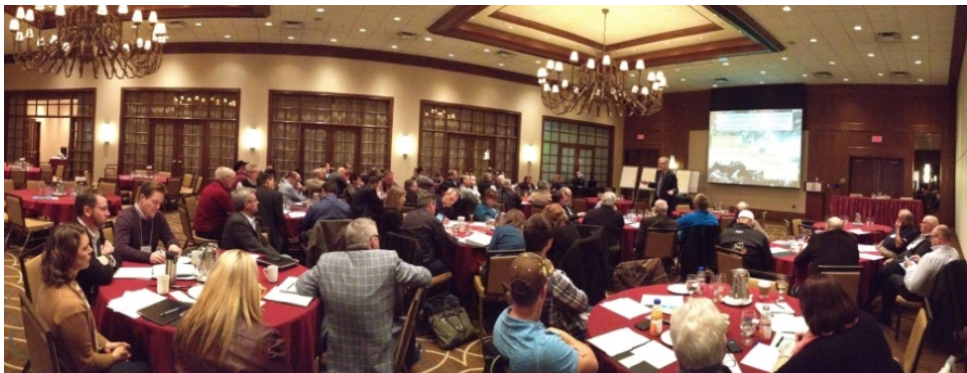
Shown above, the agricultural producers from across Alberta met early this year in Red Deer to form the Alberta Agricultural Farm and Ranch Safety Coalition.

In response to the challenges associated with Bill 6 legislation, and in support of agricultural industry sustainability, it was agreed to form an industry led coalition; an unprecedented collaboration between almost all the producer groups that form the agricultural industry in Alberta. On January 22, 2016, the Alberta Agriculture Farm and Ranch Safety Coalition (or the so-called AgCoalition) was formed. The AgCoalition was founded with the vision for improved safety cultures across the entire Alberta agricultural industry, consistent with previous work done in the agricultural sector.