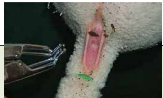
Figure 1: Proper docking length. Docking too close to the body increases the risk of prolapse.