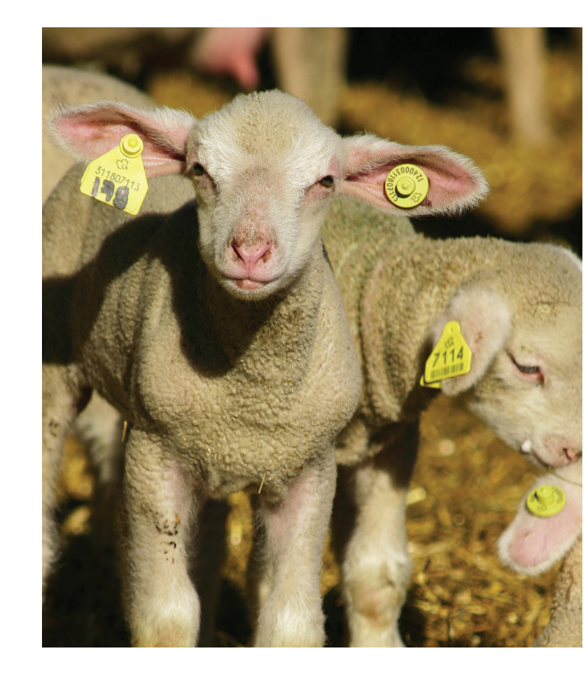
Copies of the livestock manifest have to be retained by the owner of the livestock, the livestock dealer, the transporter and the destination for 10 years.