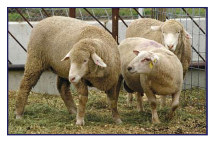
Ram lambs with good growth and performance records are a good choice for siring market lambs, but they do need special attention. They should be well grown, in good body condition and used in breeding areas where they are monitored daily.

Both rams have a similar number of progeny in the data base (40 vs 50), so the accuracy of their EPDs should be similar. Ram A has a superior Maternal EPD (4.23 vs 2.22), but remember, this is not important since you are purchasing a ram to produce market lambs, not replacement ewe lambs. Ram B has a superior Growth EPD and a superior Terminal EPD (both growth and carcass traits used in the calculation) and would be the better choice.