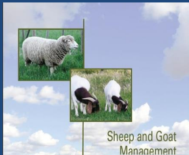
Sheep and Goat Management

Educational materials, lambing kits, webinars, videos, factsheets, and presentations/workshops.