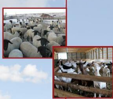
Sheep and Goat Management in Alberta Health