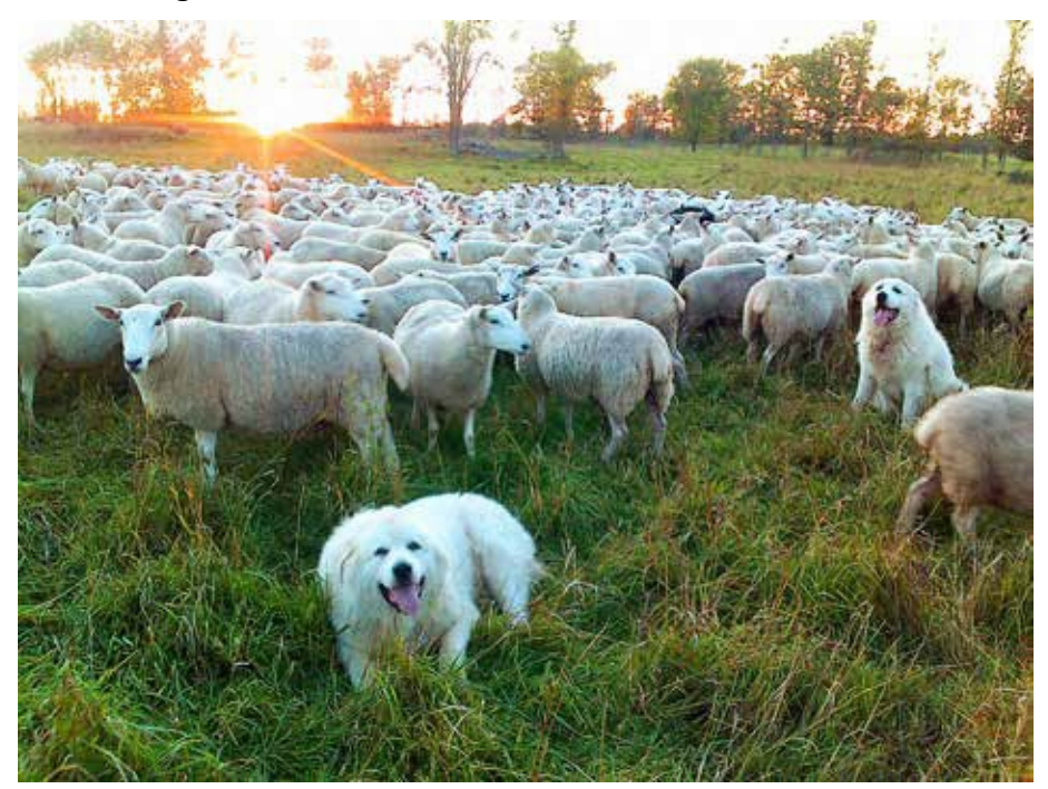
Livestock guarding dogs are the preferred guardian for most lamb producers.

Producers using multiple dogs have found that some dogs work better together than others. Where dogs are used in pairs, it can often be beneficial to switch one of the pair to increase their effectiveness, particularly when coyotes have been constantly challenging them. Paired dogs often show complementary behaviour,<sup>20</sup> with one dog being aggressive and patrolling a wide area around the flock while the second dog stayed with the sheep and responded aggressively only when directly confronted by a predator. A number of producers have observed similar behaviour in their dogs.