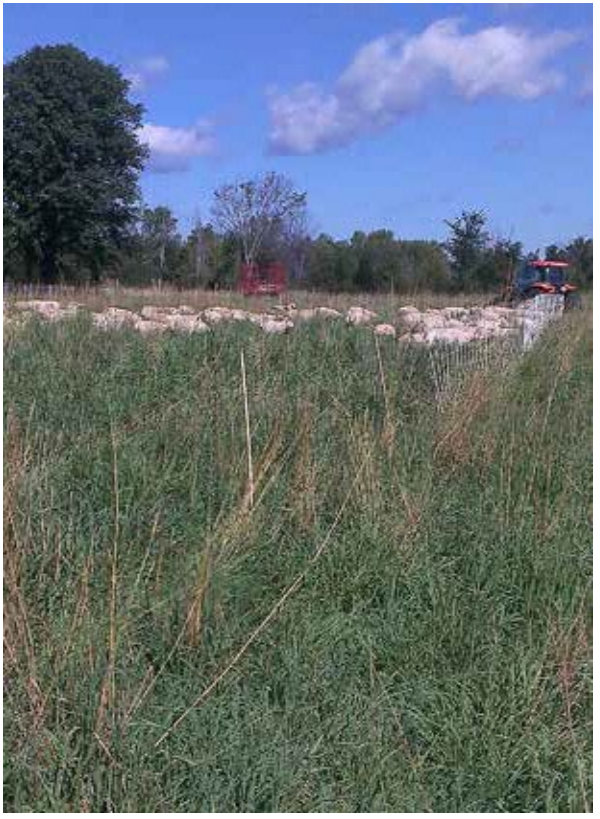
White nets are more visible to the sheep and predators alike.

between grazed and ungrazed area, and leave power turned off. Usually in a matter of a couple of hours, most ewes and lambs will have matched up and the fence can be erected and power reconnected.