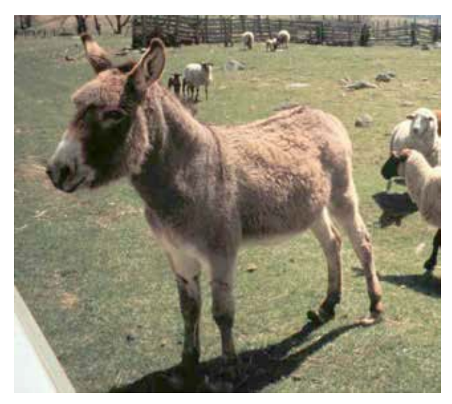
Good feet and regular trimming are essential if donkeys are to remain effective protectors.