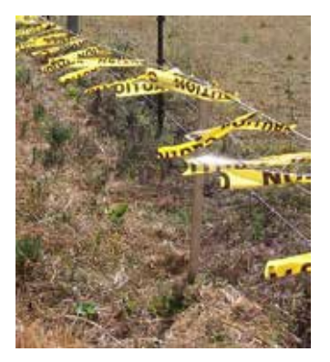
Effectiveness of fladry appears to last up to 60 days with wolves. It shows little effectiveness against coyotes.

Fladry is basically flags hanging from a rope that is stretched at a short distance (mostly 50 centimetres) above the ground. It was used in Eastern Europe to "funnel" wolves to areas where they could be captured or killed. For the purposes of protecting sheep from predation, fladry is erected around the pasture (or farm) being protected