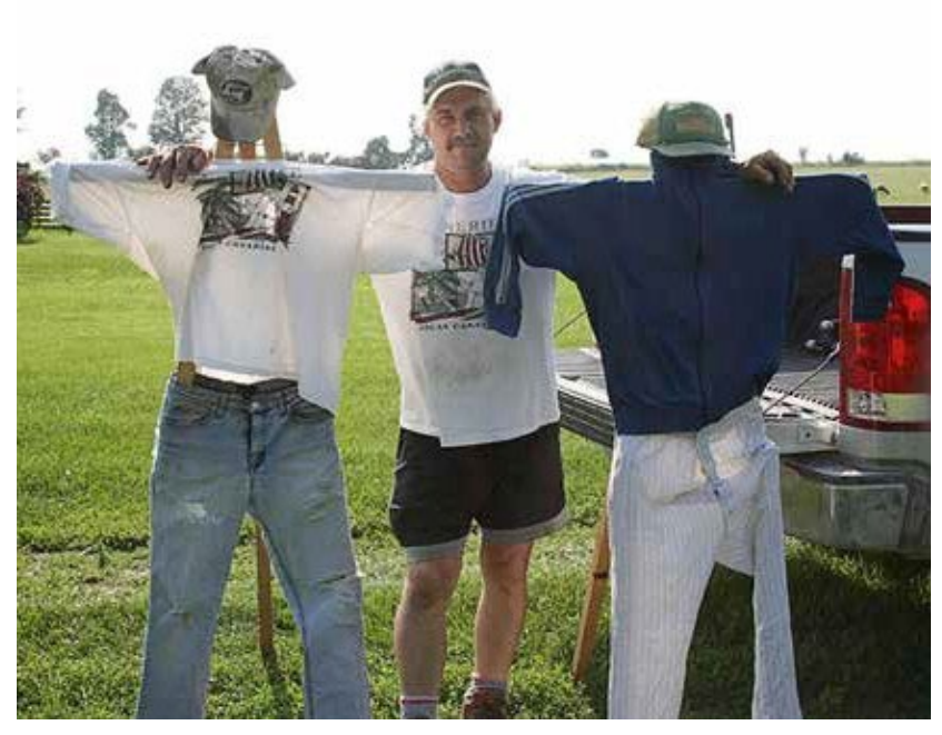
Scarecrows can help keep coyotes out of sheep pastures

Their effectiveness can be increased by using chicken wire, or hinges to join the 2x4 arms and legs so that they swing freely in the breeze. Another suggestion is to connect the