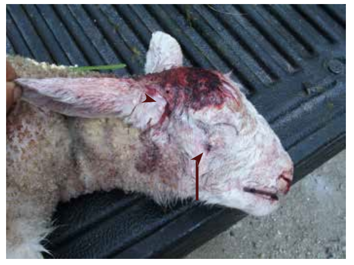
Newborn triplet lamb killed by coyote with bite to top of head.