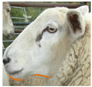
Not present = 0 Partially Present = 1