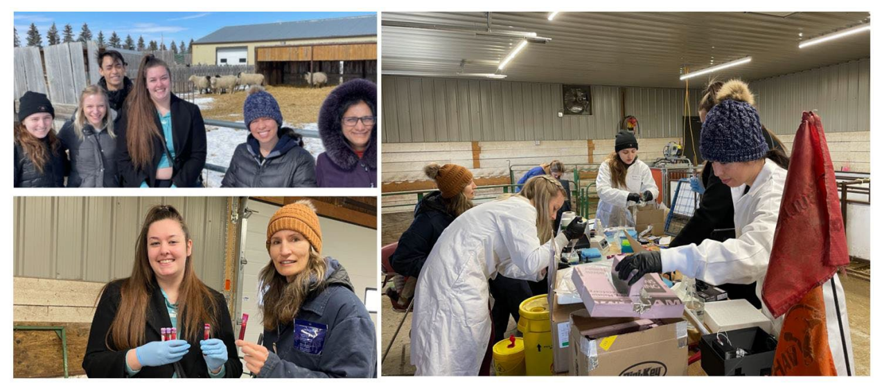
Figure 2.1 : Various members of the project tried their laboratory procedures and initial preliminary prototypes in a field test. This opportunity allowed the team to identify imperfections and to plan improvements of the current methodologies.

Unfortunately, serious issues exist with the use of the blood collection devices (ex. Tasso, "plastic leech" devices) that will need additional testing (Figure 2.4). As this was an unforeseen issue and a late added objective to our research, we question if it can be solved with the time and funds remaining. Thus, blood collection may need to be done using traditional jugular venipuncture methods with needles and syringes if alternate, novel methods cannot be found by December 2023.