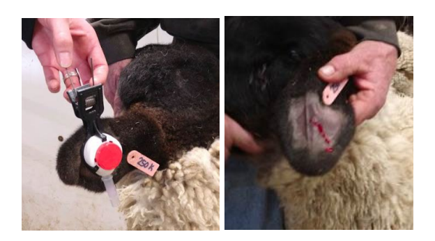
Figure 2.4 : Tasso device tested on ear with clip. The picture on the right shows the blood flowing from the ear after the clip was removed. Vacuum and suction of blood into the tube is a problem. Ear and tail locations were tested with issues at both sites.